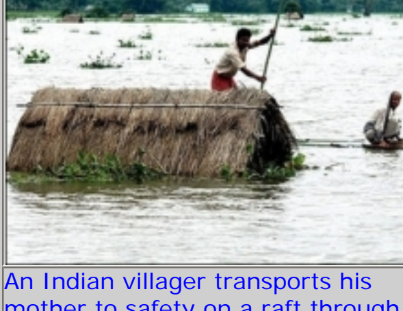
An Indian villager transports his mother to safety on a raft through floodwaters at the Kaziranga National Park, Guwahati.