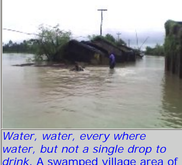
Water, water, every where water, but not a single drop to drink. A swamped village area of Dhanusha.