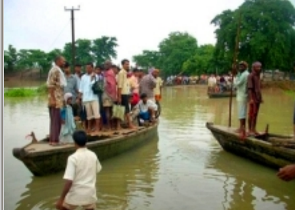
Villagers crowd into boats to be evacuated to safer areas in Rautahat, July 27, 2007.