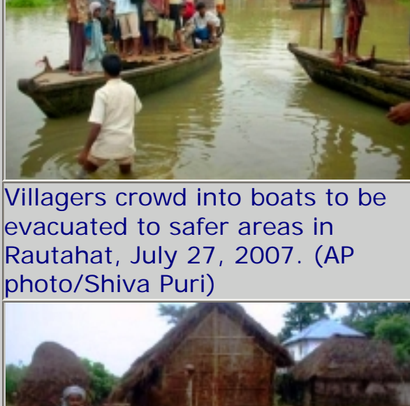
Villagers crowd into boats to be evacuated to safer areas in Rautahat, July 27, 2007.