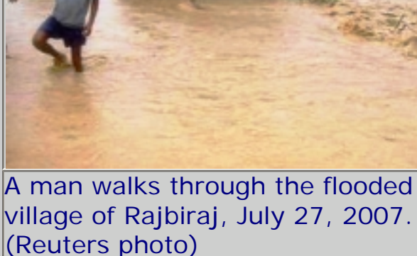
A man walks through the flooded village of Rajbiraj, July 27, 2007.