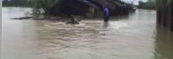
Water, water, everywhere water, but not a single drop to drink. A swamped village area of Dhanusha.